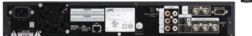
SR-HD1700US model rear panel photo shown.