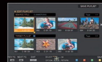
Playlist Edit on-screen display

It is possible to apply Playlist and Cut Edits to titles stored on the internal hard drive, so you can create edited videos that meet your specific needs. You can also create Auto Repeat discs that automatically loop the program for continuous playback.